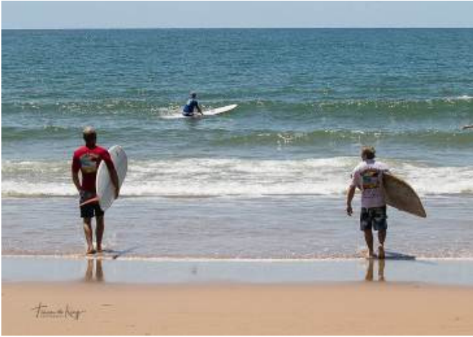
Damo and Springer heading out for their heat!