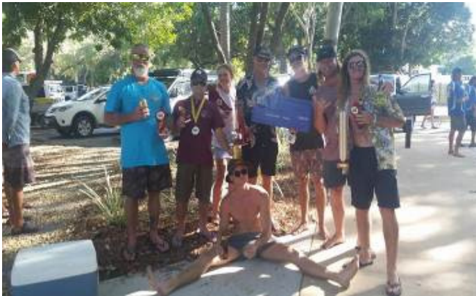
The crew celebrating their wins!